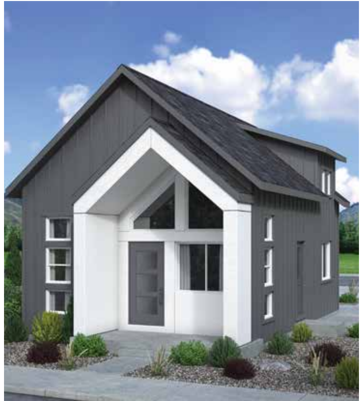
Elevation B | Optional