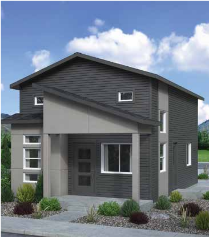
Elevation A | Standard