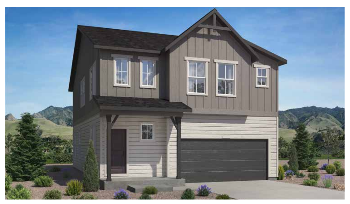
Farmhouse 335-C | Standard