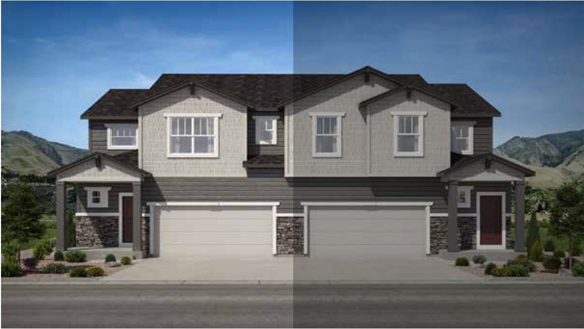
Cottage 3334-D, Unit 3