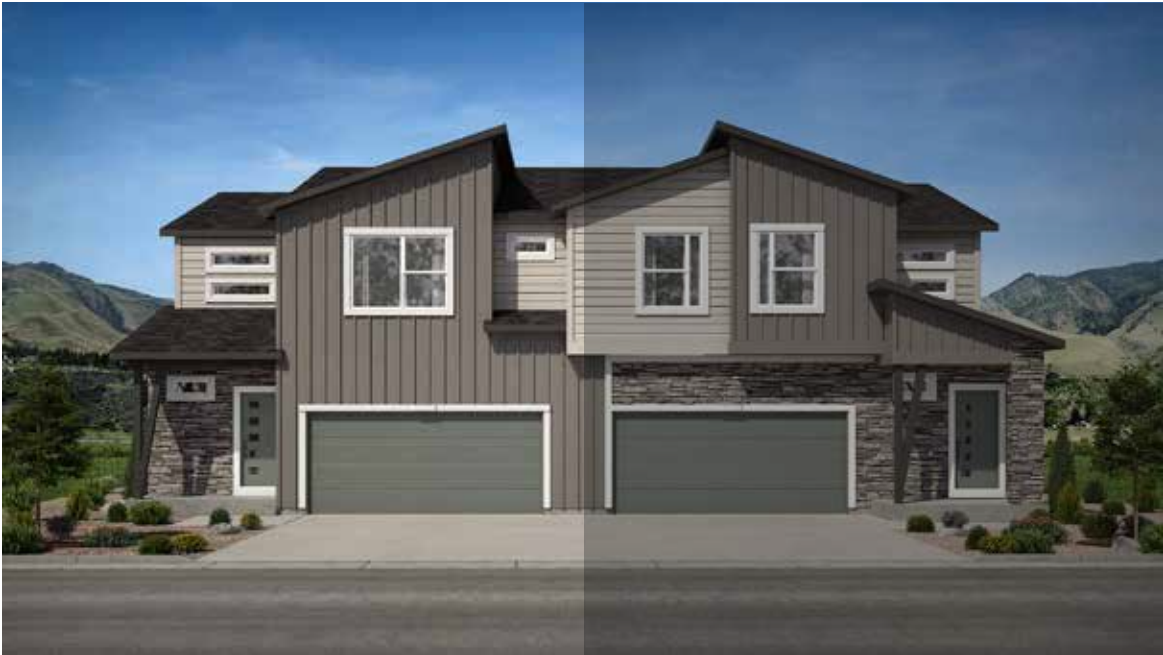
Modern 3334-E, Unit 3

Artist's conception. All plans, landscaping, features and specifications are subject to change without notification. Measurements are approximate and may vary. Homes are built to blueprint specifications which must be referenced for specific measurements. This is a marketing document and not part of your home purchase contract.