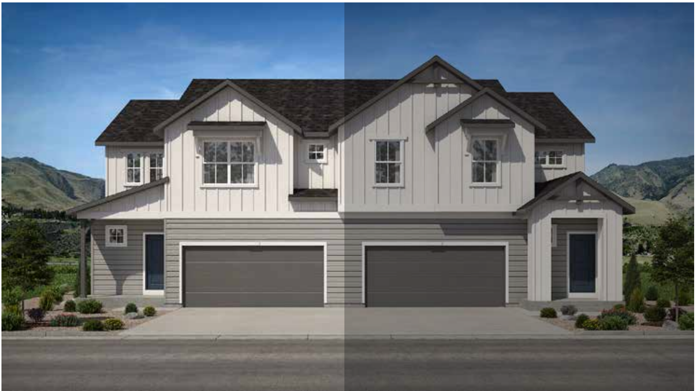
Farmhouse 3334-F, Unit 3 | Standard

*Actual square footage will vary based on selected options and chosen elevations.