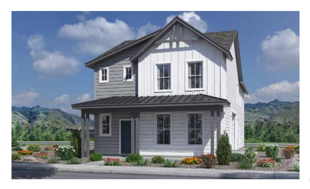
Elevation A | Optional