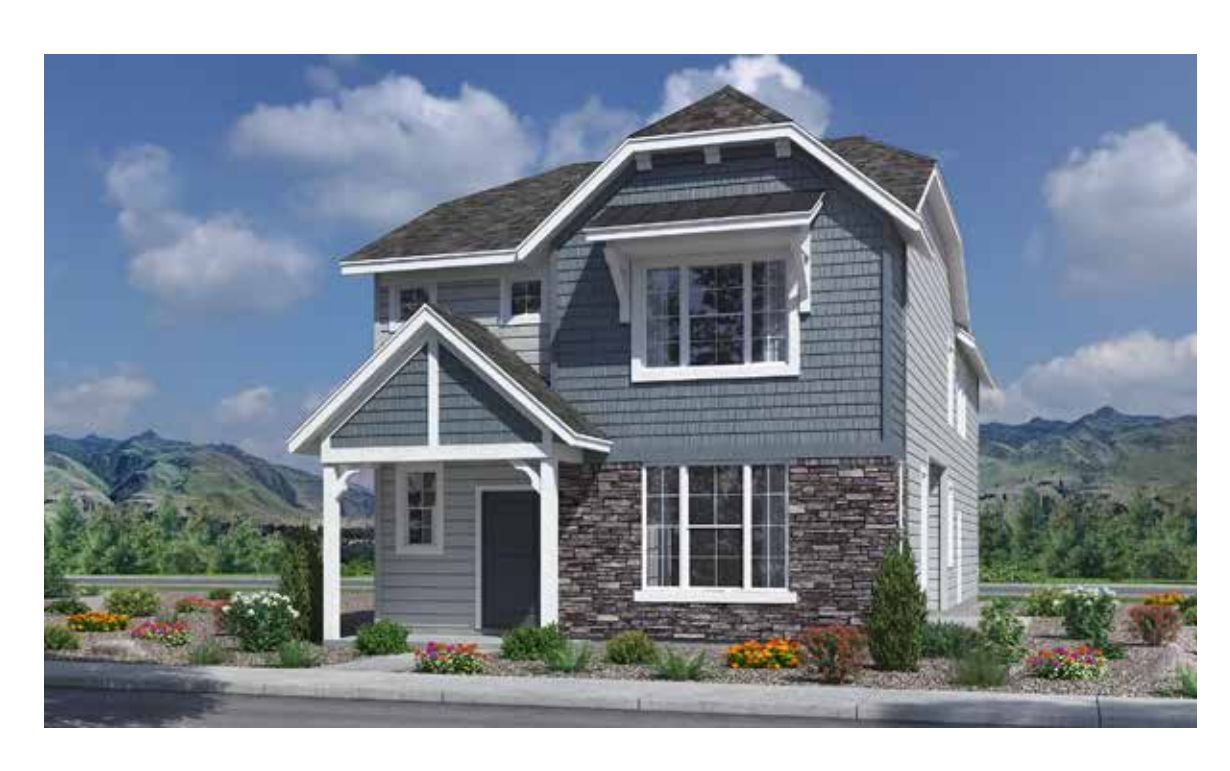
\mathsf{Elevation} \; \mathsf{C} \; | \; \mathit{Optional} \;