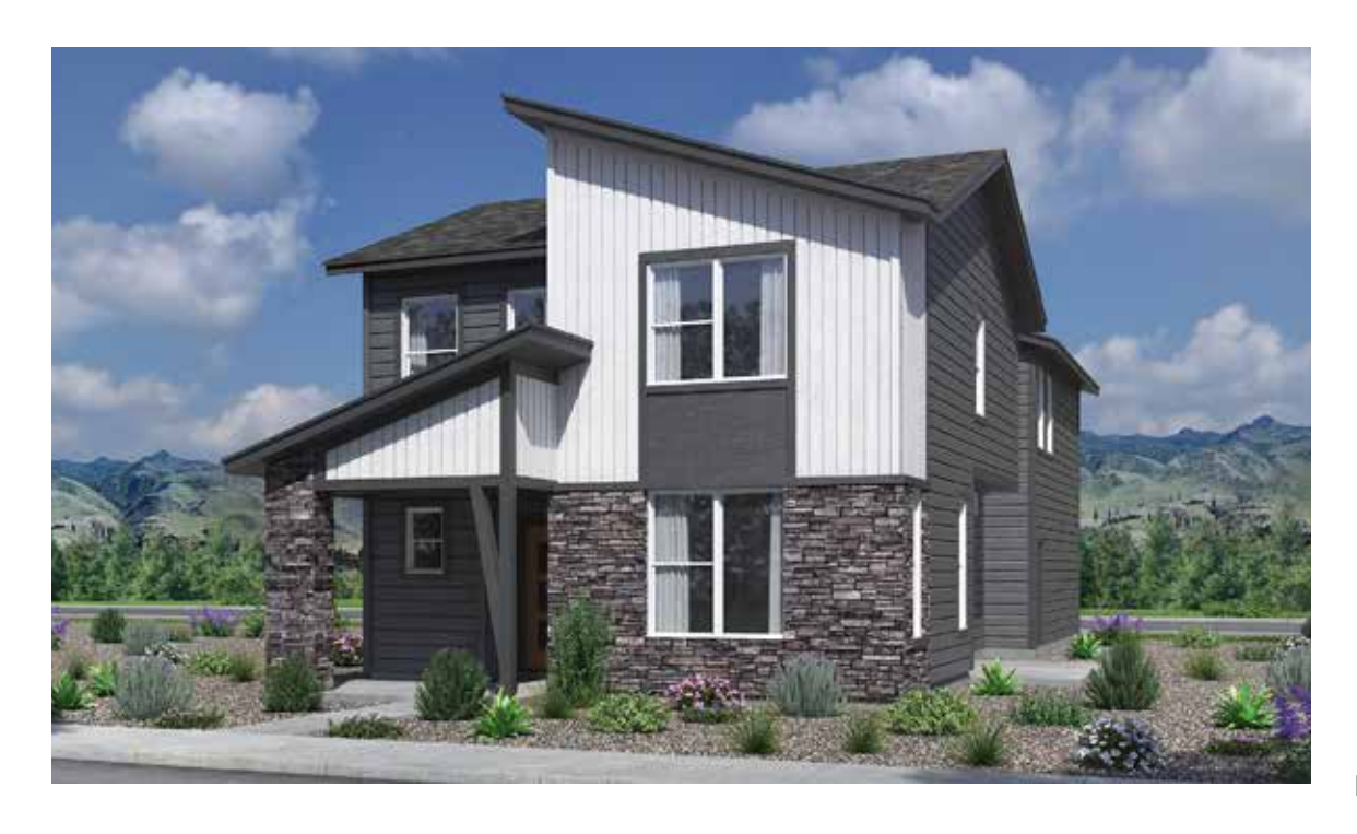
Elevation B | Optional