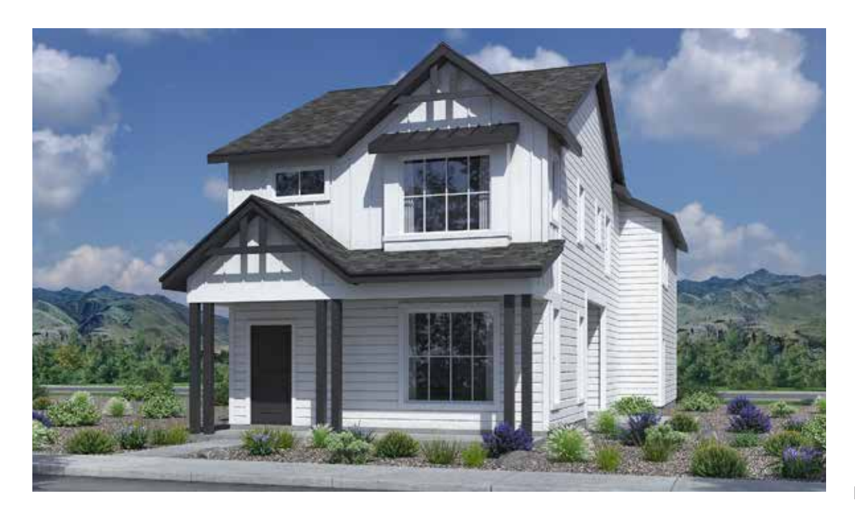
Elevation A | Optional