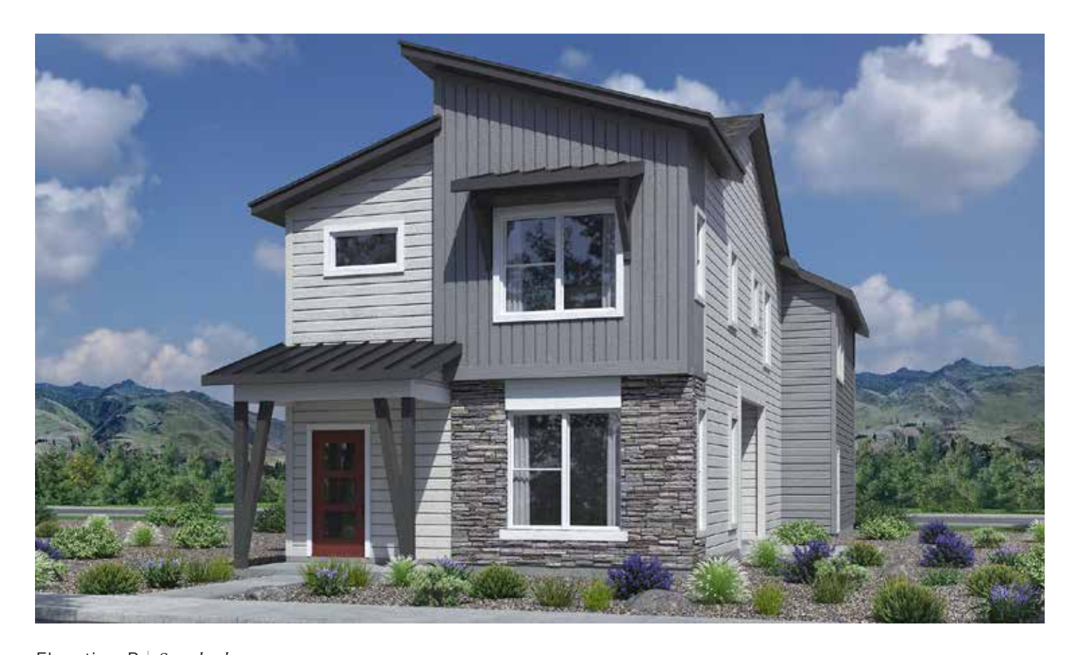
Elevation B | Standard