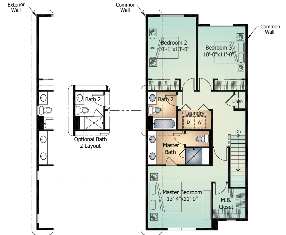
Optional End Unit Condition Elevations 'J', 'K', 'L' & 'M' Only ('L' Elevation Shown)