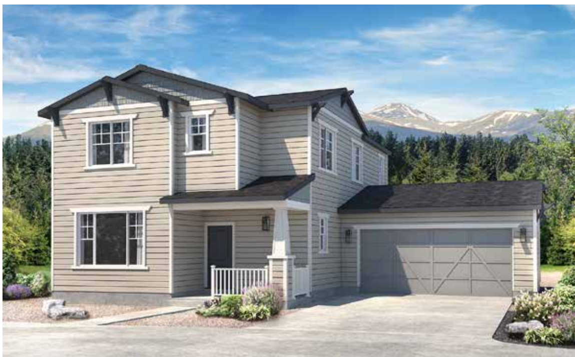
Elevation C | Optional Shown with Color Scheme 12

Artist's conception. All plans, landscaping, features and specifications are subject to change without notification. Measurements are approximate and may vary. Homes are built to blueprint specifications which must be referenced for specific measurements. This is a marketing document and not part of your home purchase contract.