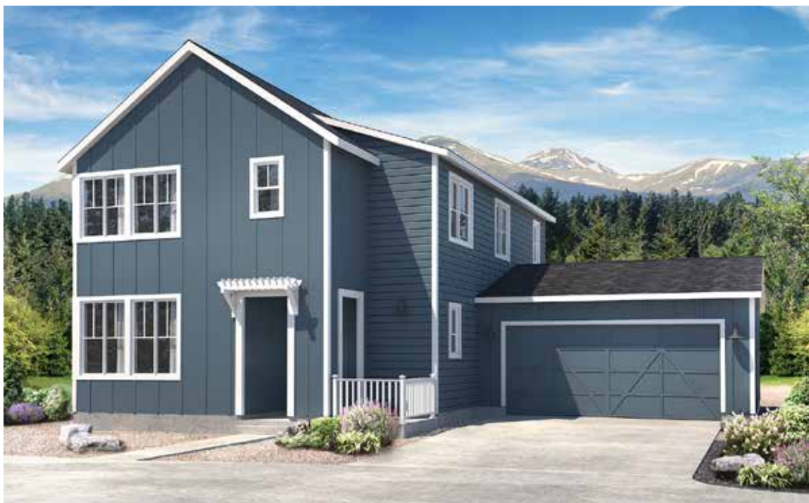
Elevation B | Optional Shown with Color Scheme 4