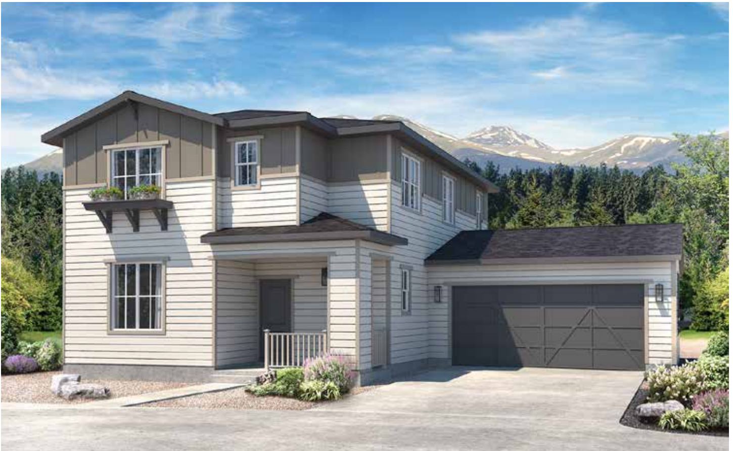
Elevation A | Standard | Shown with Color Scheme 10

*Actual square footage may vary due to added options, chosen elevations, or amount of basement finish.