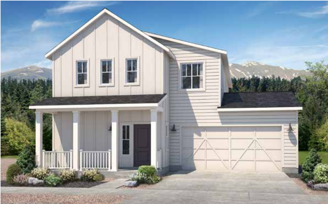
Elevation B | Optional