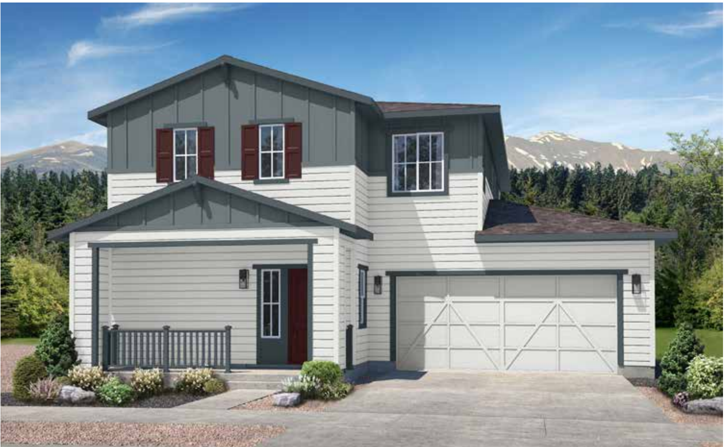
Elevation A | Standard

*Actual square footage may vary due to added options, chosen elevations, or amount of basement finish.