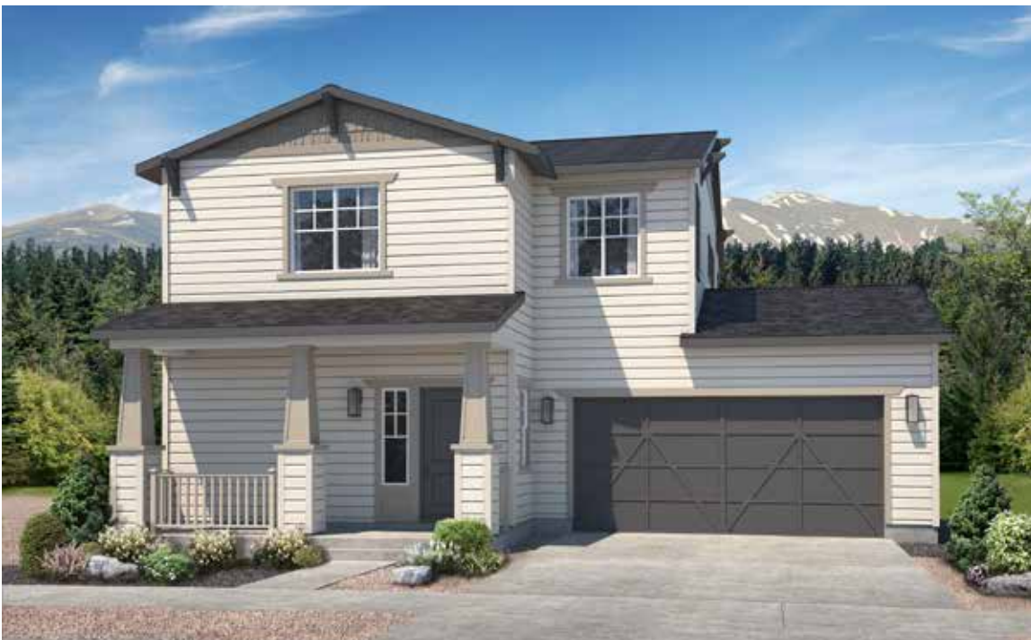
Elevation C | Optional

Artist's conception. All plans, landscaping, features and specifications are subject to change without notification. Measurements are approximate and may vary. Homes are built to blueprint specifications which must be referenced for specific measurements. This is a marketing document and not part of your home purchase contract.