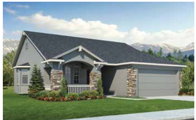
Elevation C | Optional

Artist's conception. All plans, landscaping, features and specifications are subject to change without notification. Measurements are approximate and may vary. Homes are built to blueprint specifications which must be referenced for specific measurements. This is a marketing document and not part of your home purchase contract.