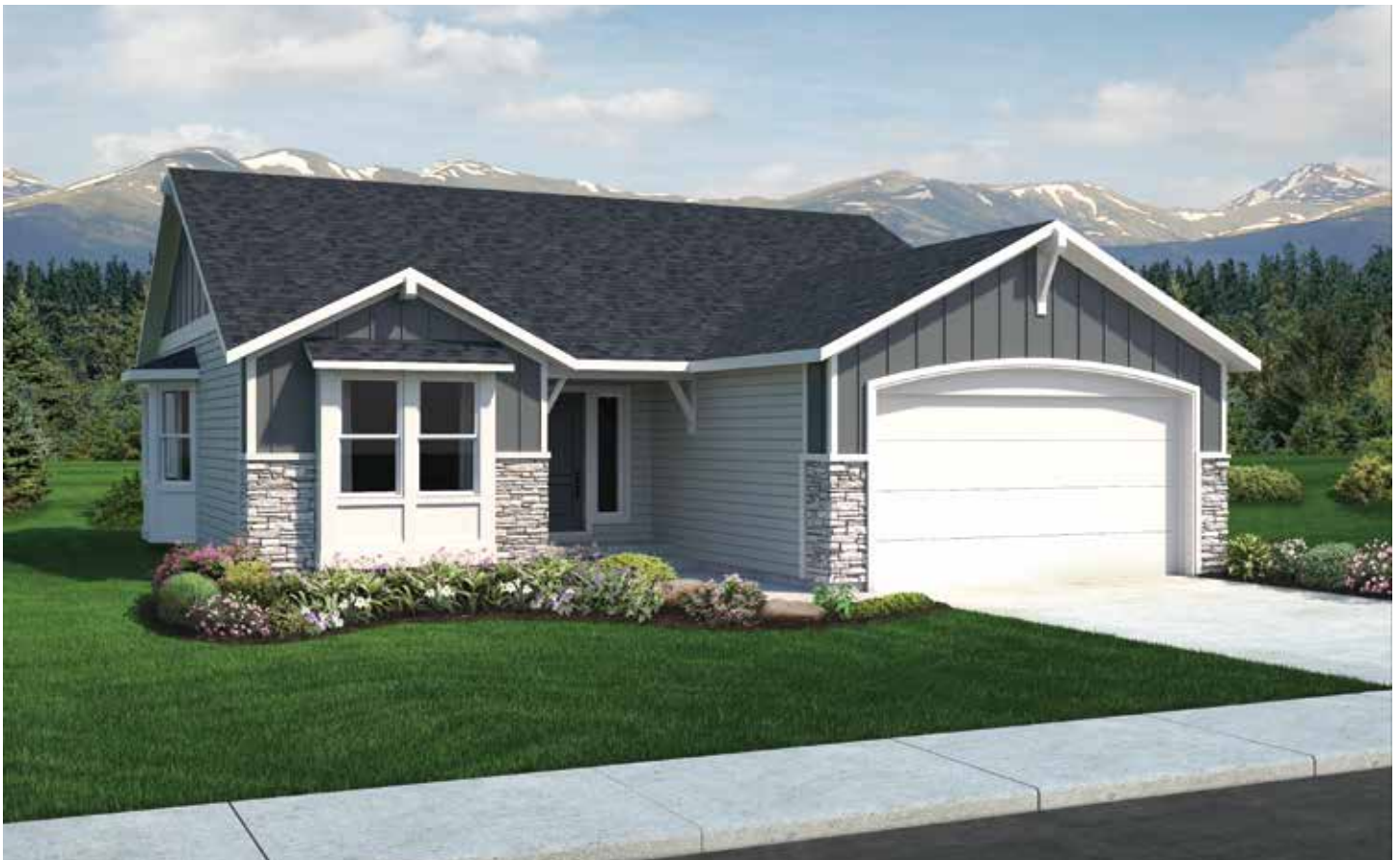
Elevation D | Standard

*Actual square footage may vary due to added options, chosen elevations, or amount of basement finish.