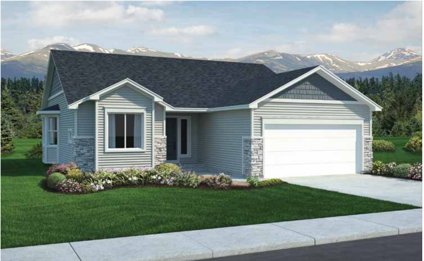
Elevation A | Optional