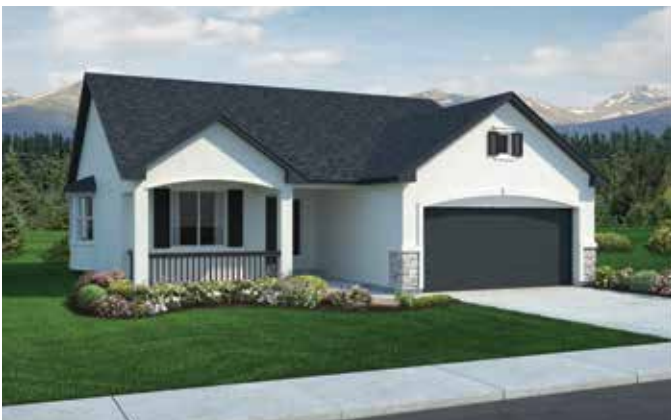
Elevation B | Optional