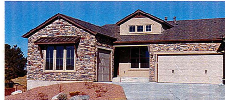
3210 Excelsior Drive

$470,205 | 3,880 SF | MLS: 9807672 Model: San Isabel Bed: 4 + Study | Bath: 4.5 | Car: 3