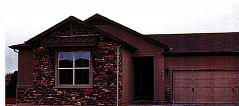
3315 Union Jack Way

$458,331 | 3,110 SF | MLS: 5276776 Model: Telluride Bed: 4 | Bath: 4 | Car: 2