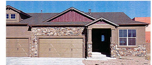
3316 Union Jack Way

$443,768 | 3,110 SF | MLS: 7618033 Model: Telluride Bed: 3 + Study | Bath: 3.5 | Car: 2