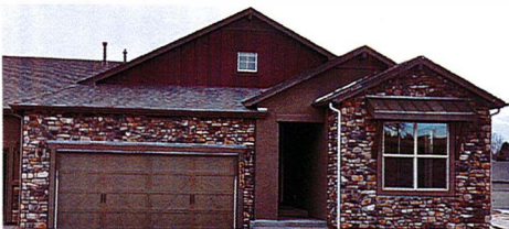
3315 Redcoat Lane

$425,827 | 2,929 SF | MLS: 6069184 Model: Avondale Bed: 4 | Bath: 3 | Car: 2