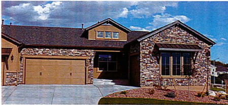
3260 Excelsior Drive

Take An Additional $8,500 Off The Published Price!