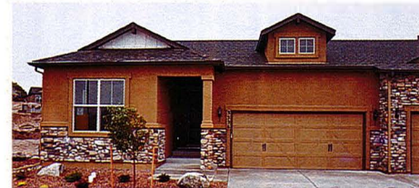
3336 Redcoat Lane

$468,432 | 3,380 SF | MLS: 7133877 Model: San Isabel Bed: 4 + Study | Bath: 4.5 | Car: 3