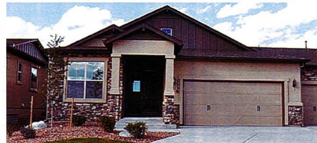
3230 Excelsior Drive

$466,247 | 3,401 SF | MLS: 5704016 Model: Maroon Bell Bed: 3 | Bath: 3 | Car: 3